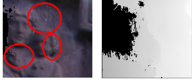
Fig. 2: Warp and blending weight discontinuities cause artifacts (in red). Left: a close-up to a view rendered by minimizing the energy 7. Right: a warp that presents visibility discontinuities that caused the artifacts.

where B_{k,m,p} = \int_{\mathbf{p}} b_k(\mathbf{x}' - \tau_k(\mathbf{x}_m)) d\mathbf{x}' is the area of intersection of the projection of the pixel in the target view and a pixel \mathbf{p} of this view. It is equivalent to bilinearly interpolate the intensities of u .