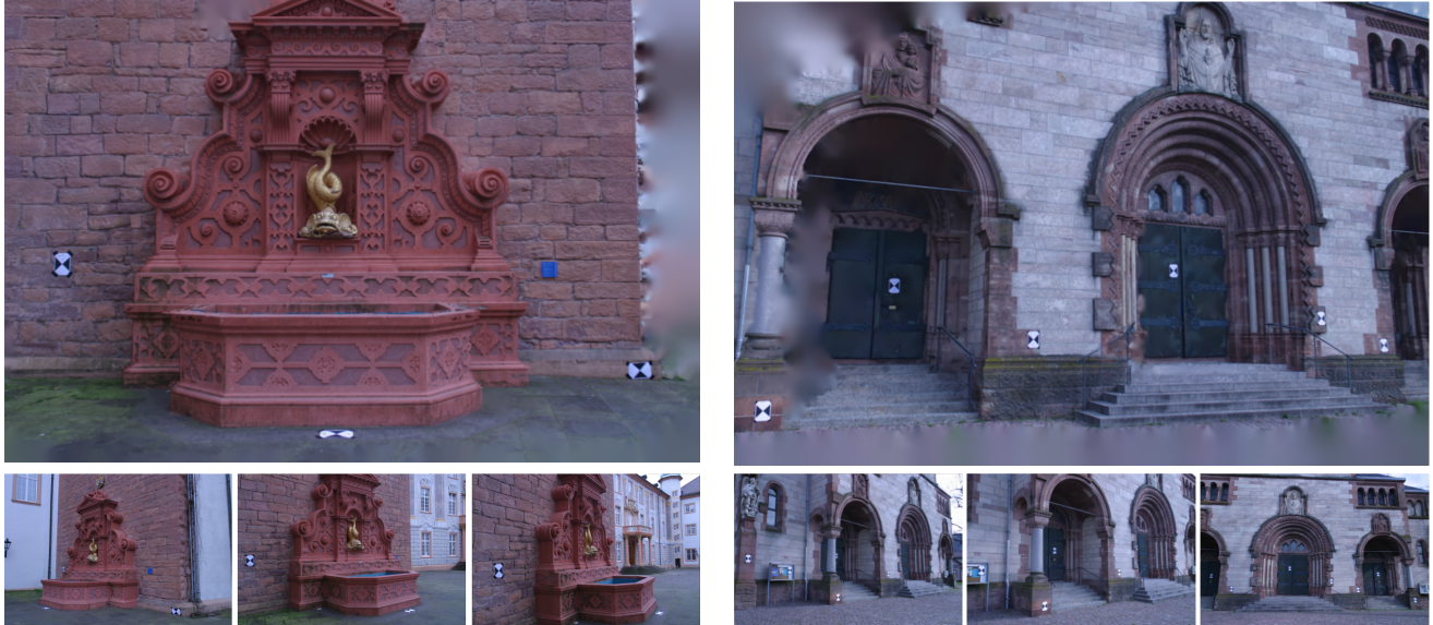
Fig. 4: Results on datasets fountain and herzesu . The bottom row shows some of the input views. Note that the parts of the target view that are not visible by any of the inputs are filled by a push/pull inpainting algorithm.

view. We use the depth to derive the blending weights as it is demonstrated in [24]. For further information about the reconstruction pipeline, more specifically occlusion handling and the derivation of the blending weights, see [21].