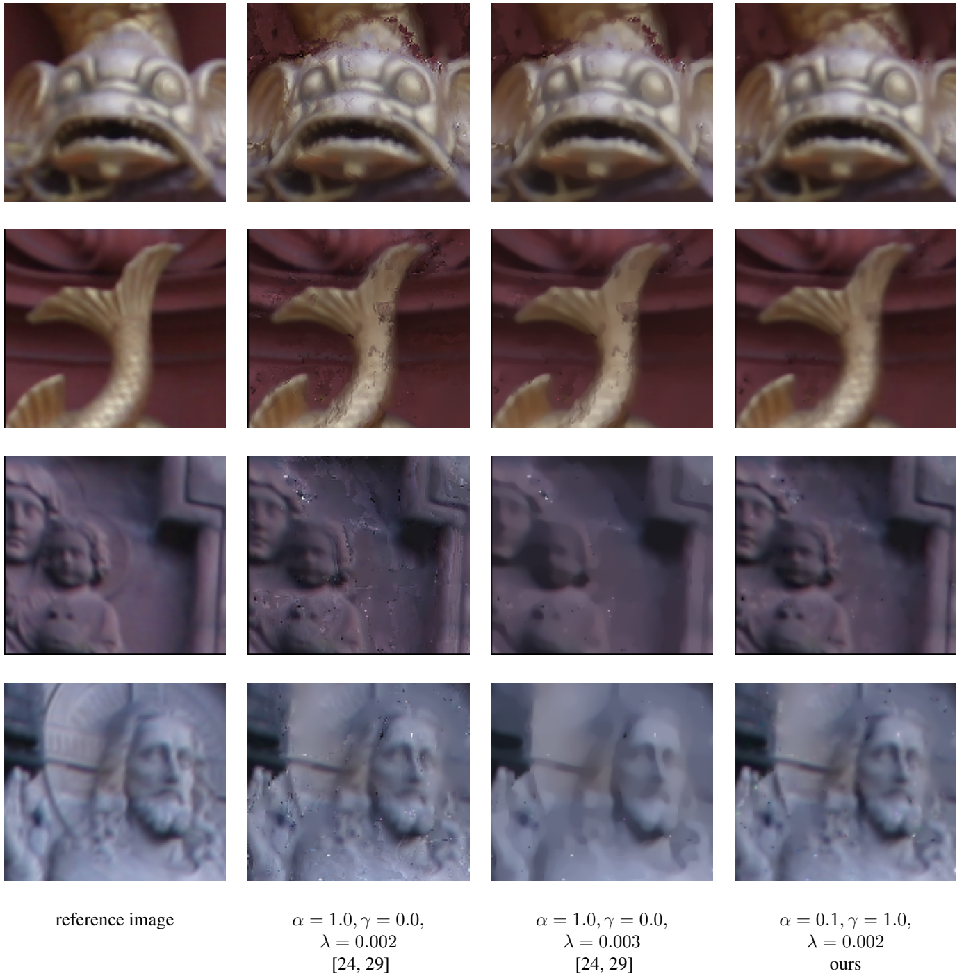
Fig. 5: Rendering the central view with different energy parameters. Each column shows the results on datasets fountain and herzjesu [27] by applying a special set of parameters ( \alpha, \gamma, \lambda ) that control the amount of terms in the energy formula 17. Proposed approach is for \gamma \neq 0 . State-of-the-art approach [24, 29] creates high-frequency artifacts due to blending intensities only. A higher smoothness parameter \lambda = 0.003 partially removes these artifacts at the cost of detail loss. Our approach preserves detail and show finer results by appending constraints of the gradients of the solution, forcing a Laplacian blending.